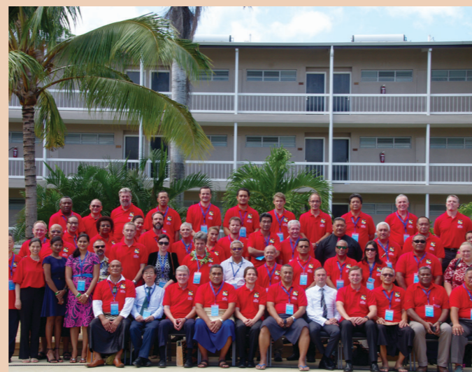
Representative of the Thematic Hubs, National Focal Institutions, Development Partners and heads of PIC Energy Offices at the First Steering Committee Meeting