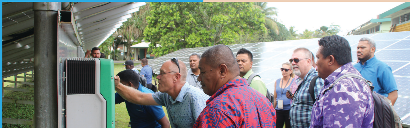
Participants at a regional training on promoting sustainable energy entrepreneurship in the PICTs