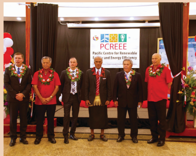
Reps of PIC leaders, UNIDO, Austria and SPC at the launch of the PCREEE