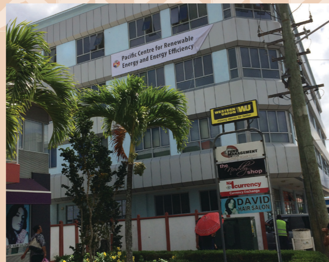
The PCREEE Office at the Third Floor of O. G. Sanft Building at Nuku'alofa