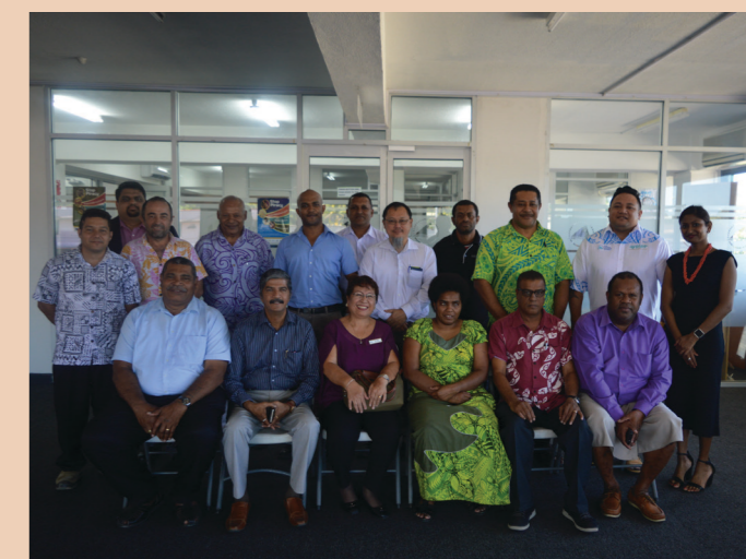
Participants at a training on sustainable energy business start up in Fiji