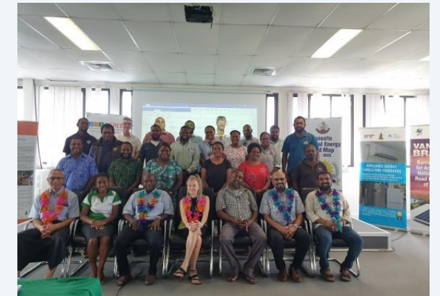
Vanuatu National Energy Dialogue