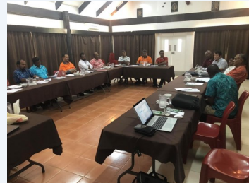
Formation of the Fiji Sustainable Energy Consortium