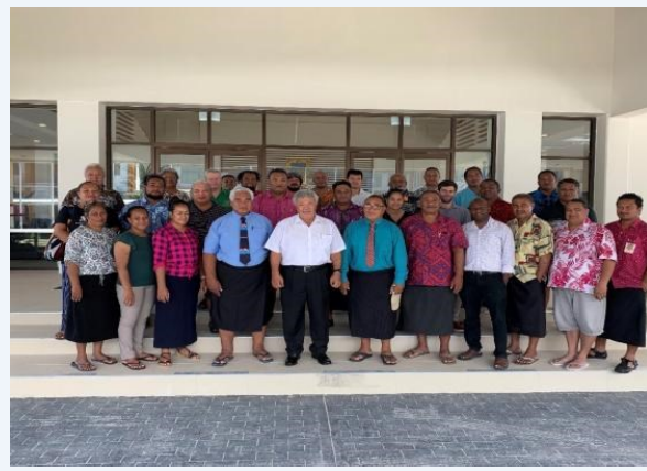
The Tuvalu National Energy Dialogue was led by the Hon. Prime Minister Enele Sopoanga.