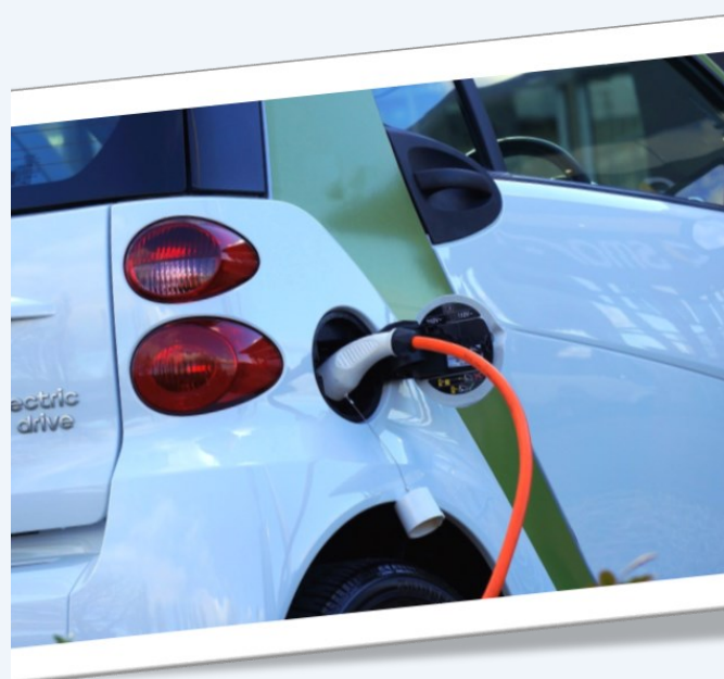
Draft regional e-mobility policy and programme is now available for virtual validation.