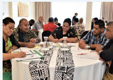
Consultation Workshop on the Tonga Energy Efficiency Master Plan