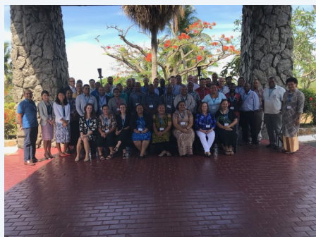
Regional Workshop on PPA