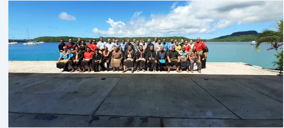
4th PCREEE Steering Committee Meeting & Tonga Energy Sector Stakeholders & Joint Development Partners Meeting INT DEVELOP-

There is optimism as the PCREEE enters the final year of its FOP and we owe it to all our partners for their confidence and support .